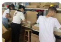
10 Product Packaging