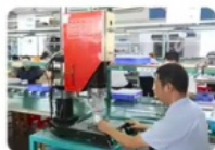
6 Ultrasonic welding