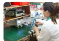
8 function test