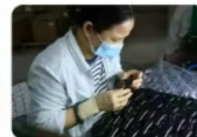
4 Shell material detection