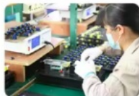
2 Fast charge test