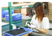
9 Appearance inspection